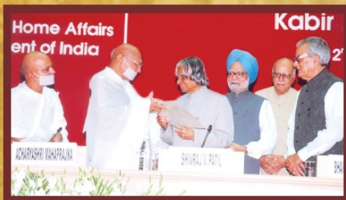
ACHARYA SHRI MAHAPRAGYAJI RECEIVING HONOUR FROM HON. SHRI ABDUL KALAM, PRESIDENT OF INDIA, YEAR 2004